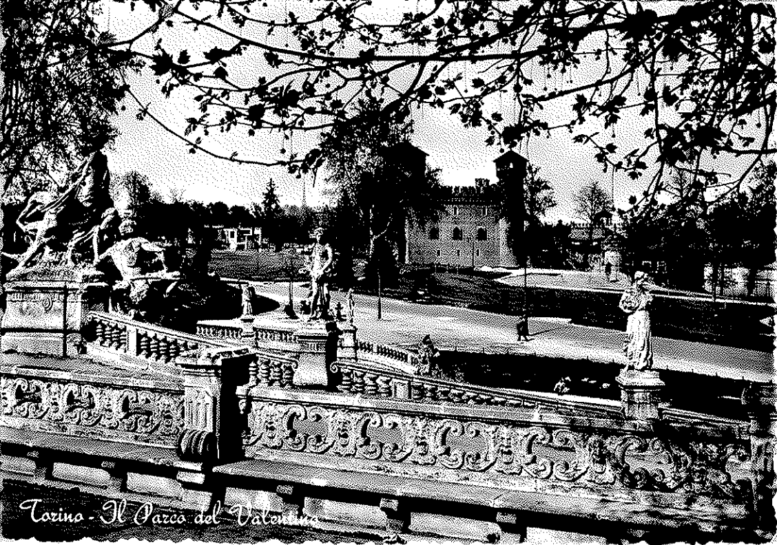
Torino - Il Parco del Valentino